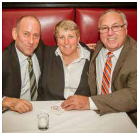
2017 Annual Awards Ceremony