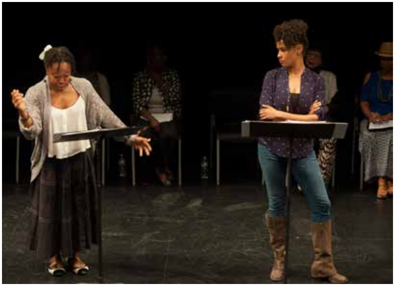
The CWA 1180 Retirees TheaterWorks! Final Performance