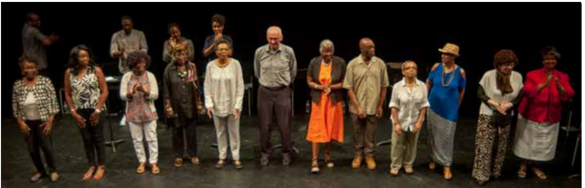
Photos: The 32BJ TheaterWorks! Class (top); the CWA 1180 Retirees TheaterWorks! Class (bottom)