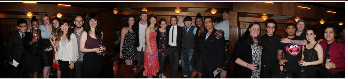
Opening Night photos of the designers, cast, and crew of Cherry Smoke .