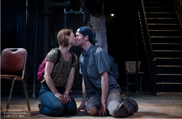
Cherry Smoke 1398-1253-3840