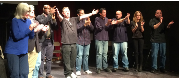
The actors and playwrights of 32BJ TheaterWorks! (above) and DC37 TheaterWorks! Group B (below)